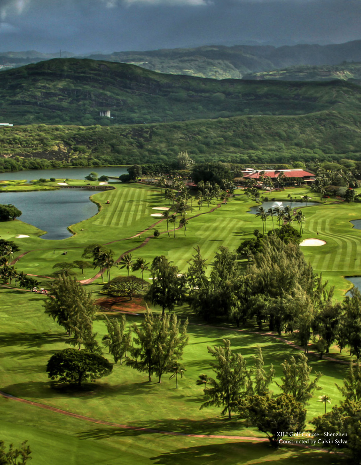
XILI Golf Course - Shenzhen Constructed by Calvin Sylva