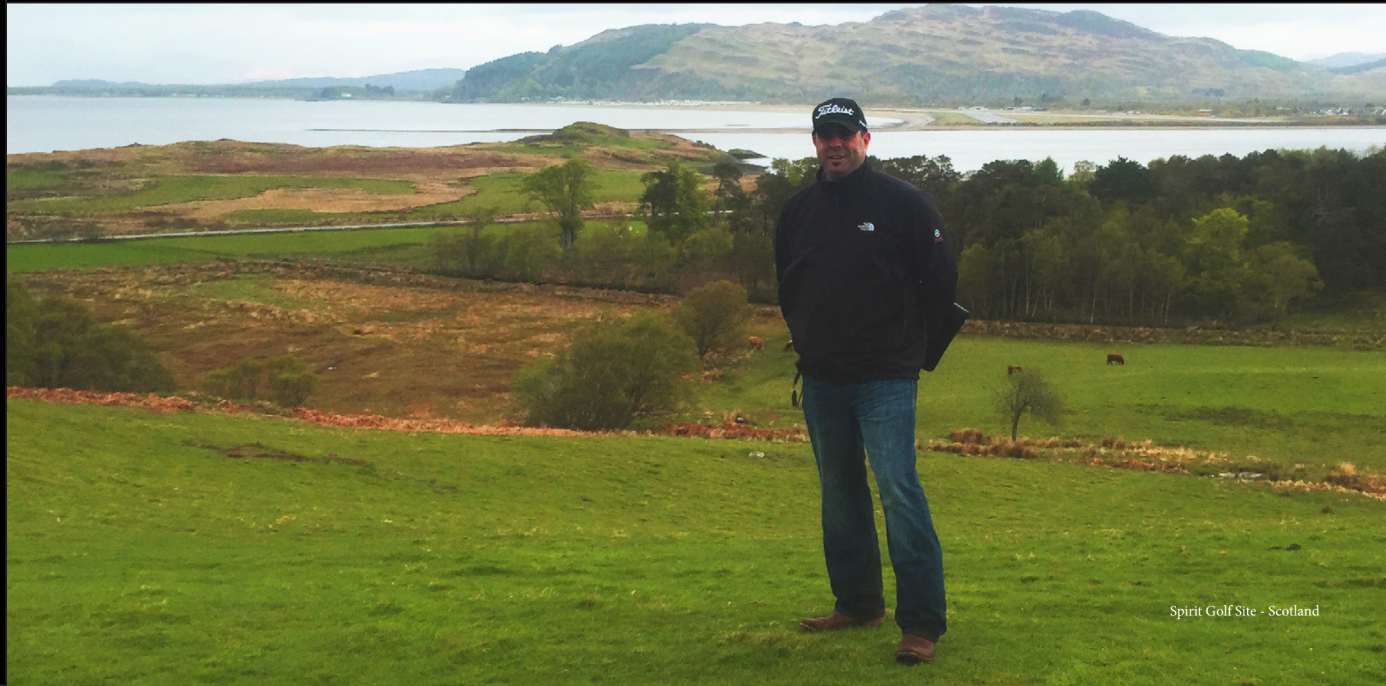
Spirit Golf Site - Scotland